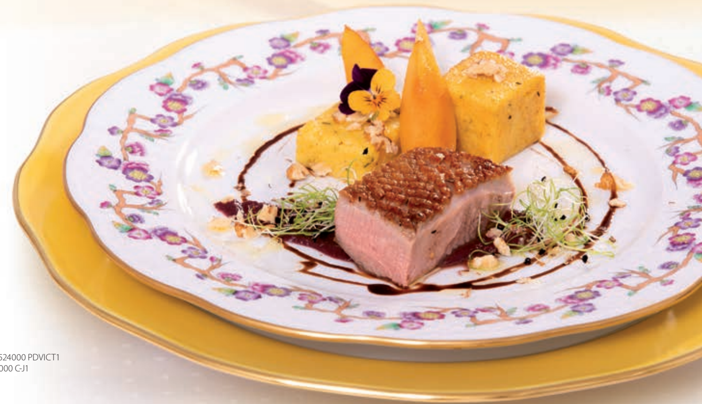
Diner plate 20524000 PDVICT1 Charger 20158000 CJ1