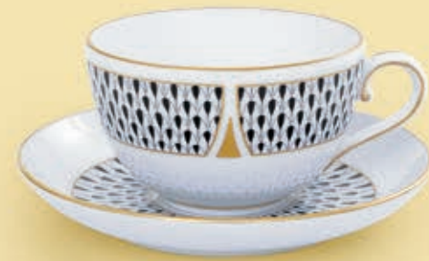
06 Teacup w. saucer 02703100VHNKN, 02703200VHNKN