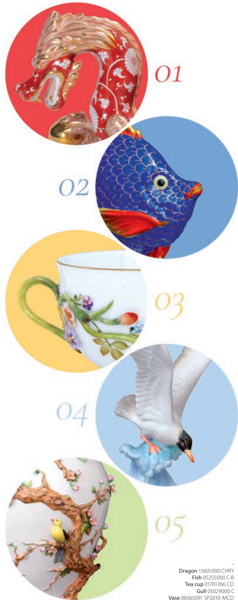
Dragon 15601000 CHRY Fish 05255000 G-B Tea cup 01701266 CD Gull 05029000 C Vase 06565091 SP2010-MCD

The raw material of Herend porcelain and its production is in itself a special process as, in addition to the secret formula of kaolin, feldspar and quartz, five elements are needed, namely: fire, water, air, earth and wood.