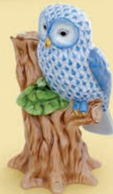
05 Owl on branch 05831000VHBM+C