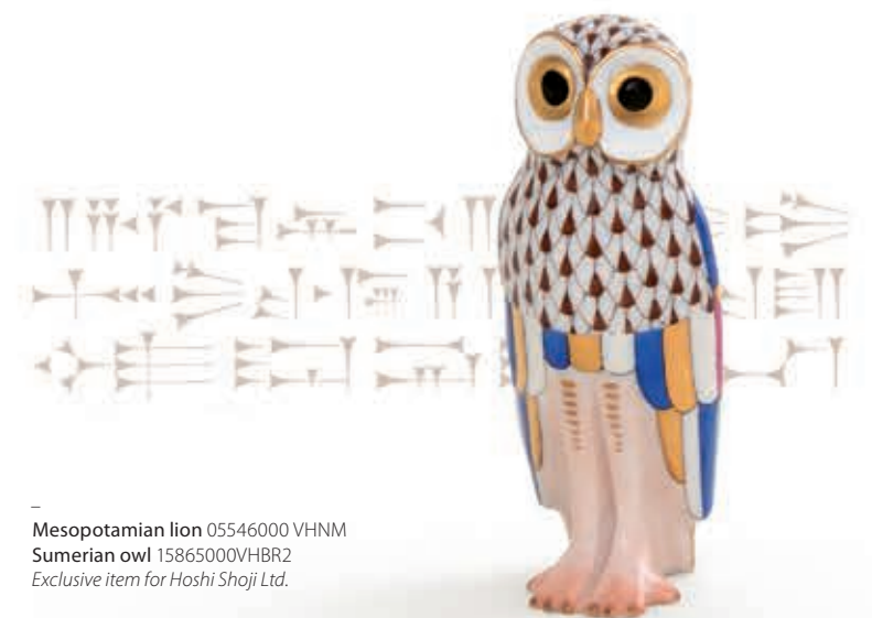
Mesopotamian lion 05546000 VHNM Sumerian owl 15865000VHBR2 Exclusive item for Hoshi Shoji Ltd.

We spend the night on a boat, as we must take to the water to reach the city-state of Uruk on the Euphrates. Uruk was founded by the Sumerians and the city is renowned for many innovations, including the science of writing, which is taught in the local schools. Instead of writing in pictures and symbols, they use cuneiform - although they dispute with the Egyptians over who invented it first. For Uruk writing, they use soft clay tablets, impressing the text into them with reed styli, and then dry or bake the tablets in the sun. It seems very simple, but it took a long time to write down an epic about Gilgamesh, the King of Uruk (one of humankind's oldest written sources)... The dozens of bazaars of the rich merchant city tempt us to buy souvenirs, but even if we cannot find anything that matches our taste, one thing is certain: we will return home with the gift of civilisation.