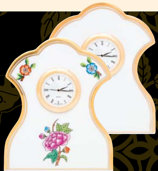
Table clocks (8085-0-00)

On the cover: The PRESENT cup