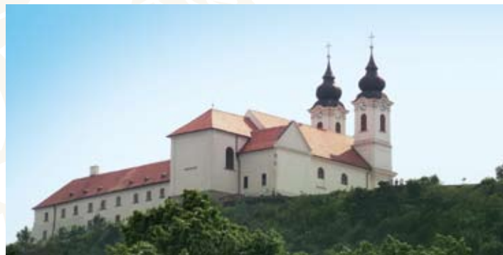
The Abbey in Tihany

On the morning of the Anna Ball, several hundred visitors had the opportunity to take part in a festive occasion in the Gallery of