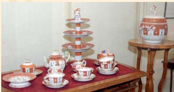
Porcelain with Gödöllő pattern in the Royal Palace of Gödöllő