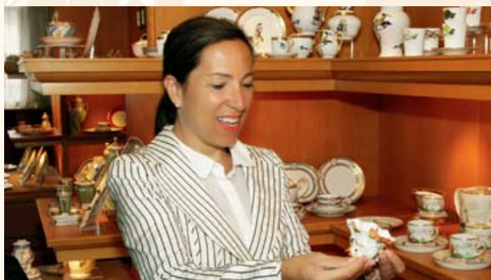
Eleni Tsakopoulos Kounalakis